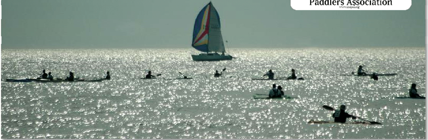
Photo of 11th Annual Paddle for the Bay